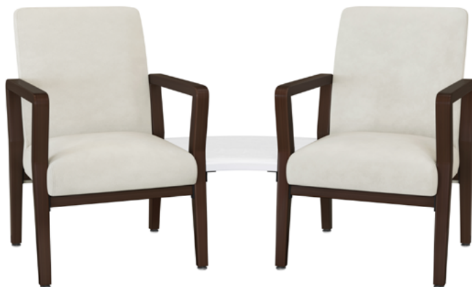
Model: CRLKTBLBE (Also displayed with two CRGE. Not included.) 26W 21.5D 1.5H

Kwalu Linking Tables add a level of functionality placed inline and in corners between guest and bariatric seating models. Choose square, rectangular, and wedge-shaped tables for visitors to place devices and other items in healthcare wait spaces. The Carrara Wedge is available with optional rounded corners.